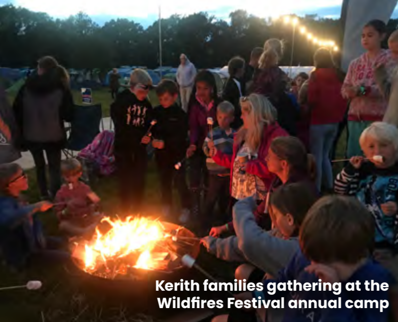
Kerith families gathering at the Wildfires Festival annual camp