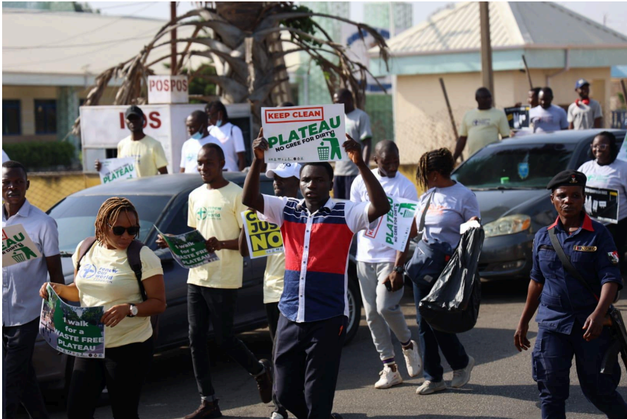
Renew our World waste demonstration in Nigeria.