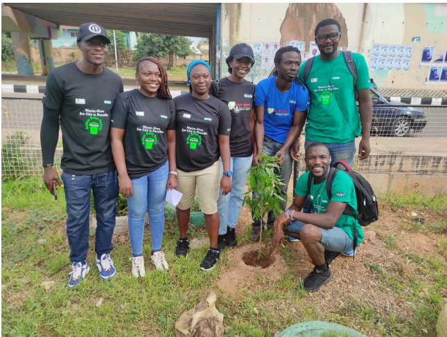
Renew our World tree planting in Nigeria.